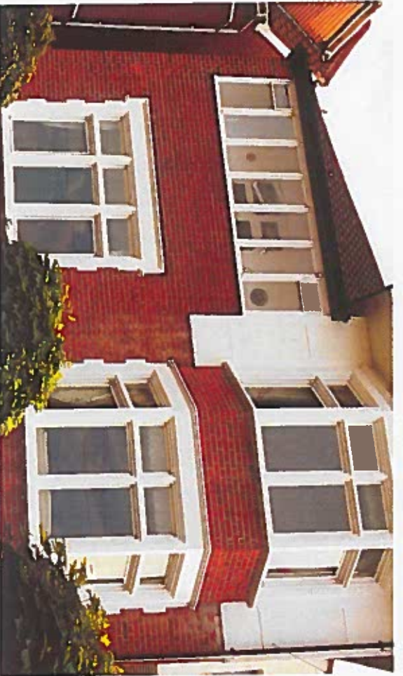
No 3 LEIGH PARK ROAD BALCONY BRICKED UP