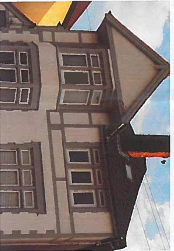
No 7 LEIGH PARK ROAD BLOCKED UP TO LOOK LIKE STONE SURROUNDS TO WINDOWS