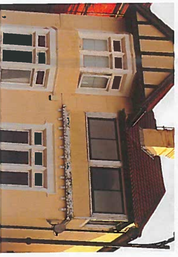
No 9 LEIGH PARK ROAD ENCLOSED BALCONY